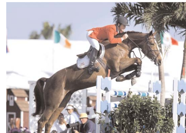
McLain Ward riding Sapphire, United States' McLain Ward and Sapphire Take Home Biggest Prize in U.S. Outdoor Show Jumping History in €300,000 CN Worldwide Florida Open Grand Prix, CSI-5*