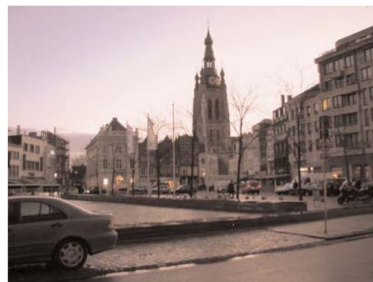
Town of Kortrijk, where we stayed.