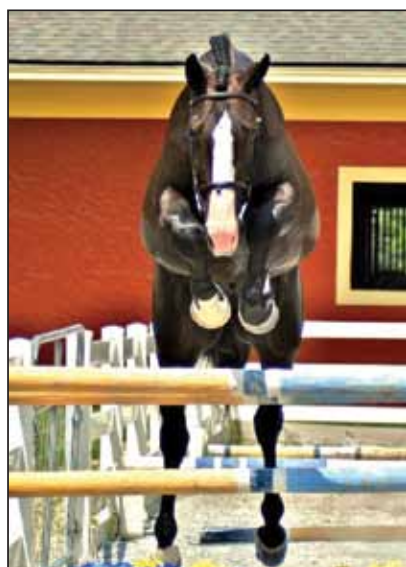
'Jett B' (Simsalabim x Chin Chin) owned by Iconic Bay Equestrian